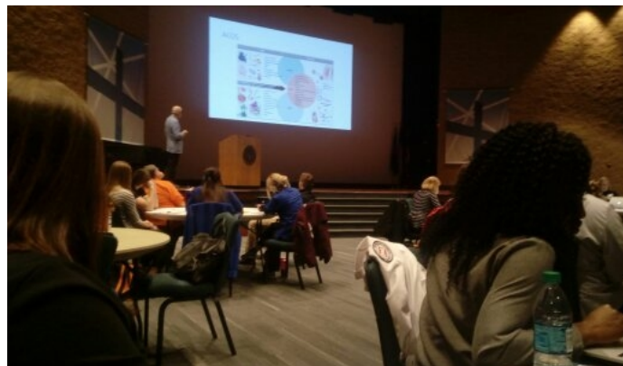
The inter professional collaboration to improve patient care.