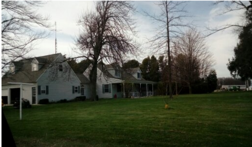
Peaceful home in Findlay