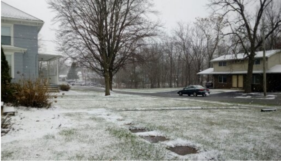
Snowy day in Findlay