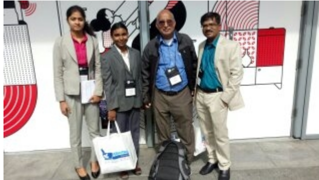
APhA delegates from India.