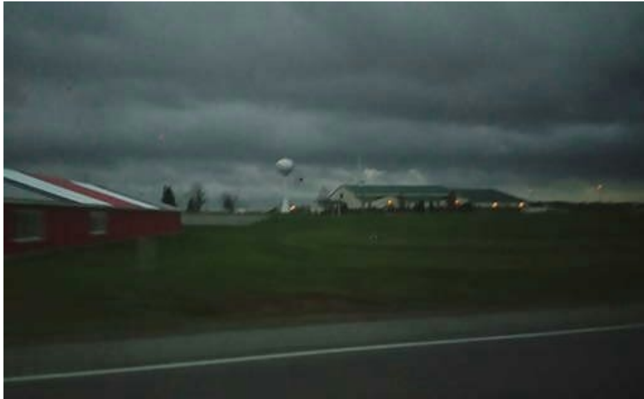
Rainy day in Upper Sandusky