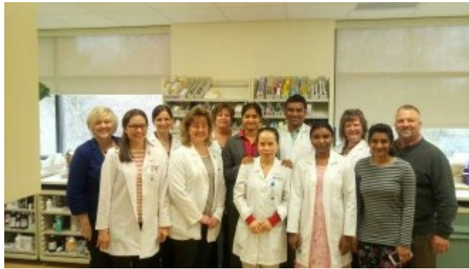
With the pharmacy staff and interns in Wyandot memorial hospital, upper Sandusky.