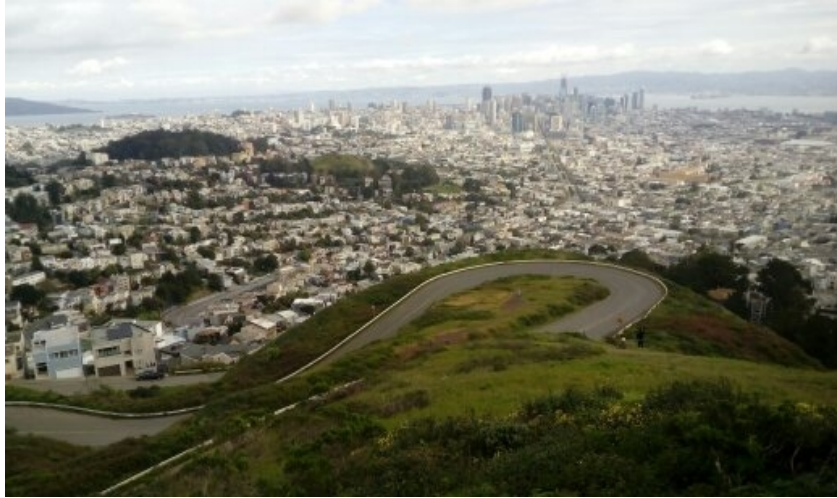
Mountain view of San Francisco.